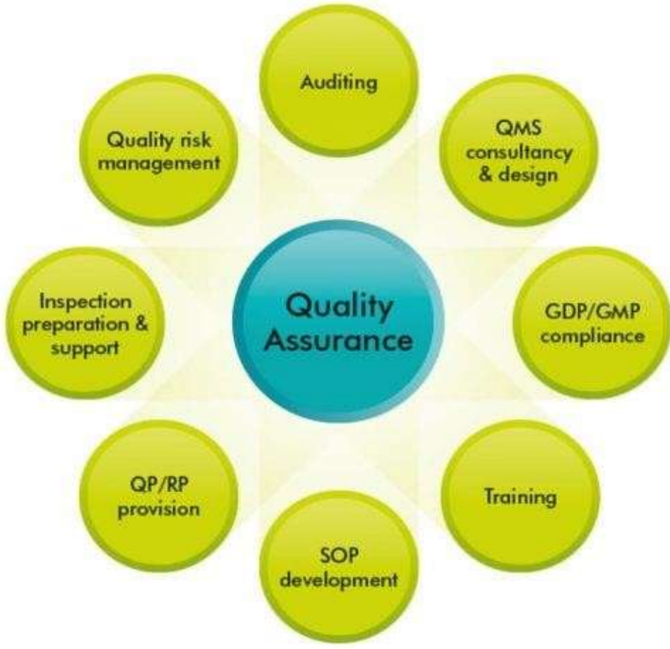
Fig:-scope of quality assurance in pharmaceutical[40]

Discuss and analyse the importance of implementing quality assurance in public and private medical laboratories or hospital laboratories. Also, include the benefits to the general public and community in doing so. It is important to discuss the importance of quality assurance in the healthcare, pharmaceutical, and bioprocessing industries.