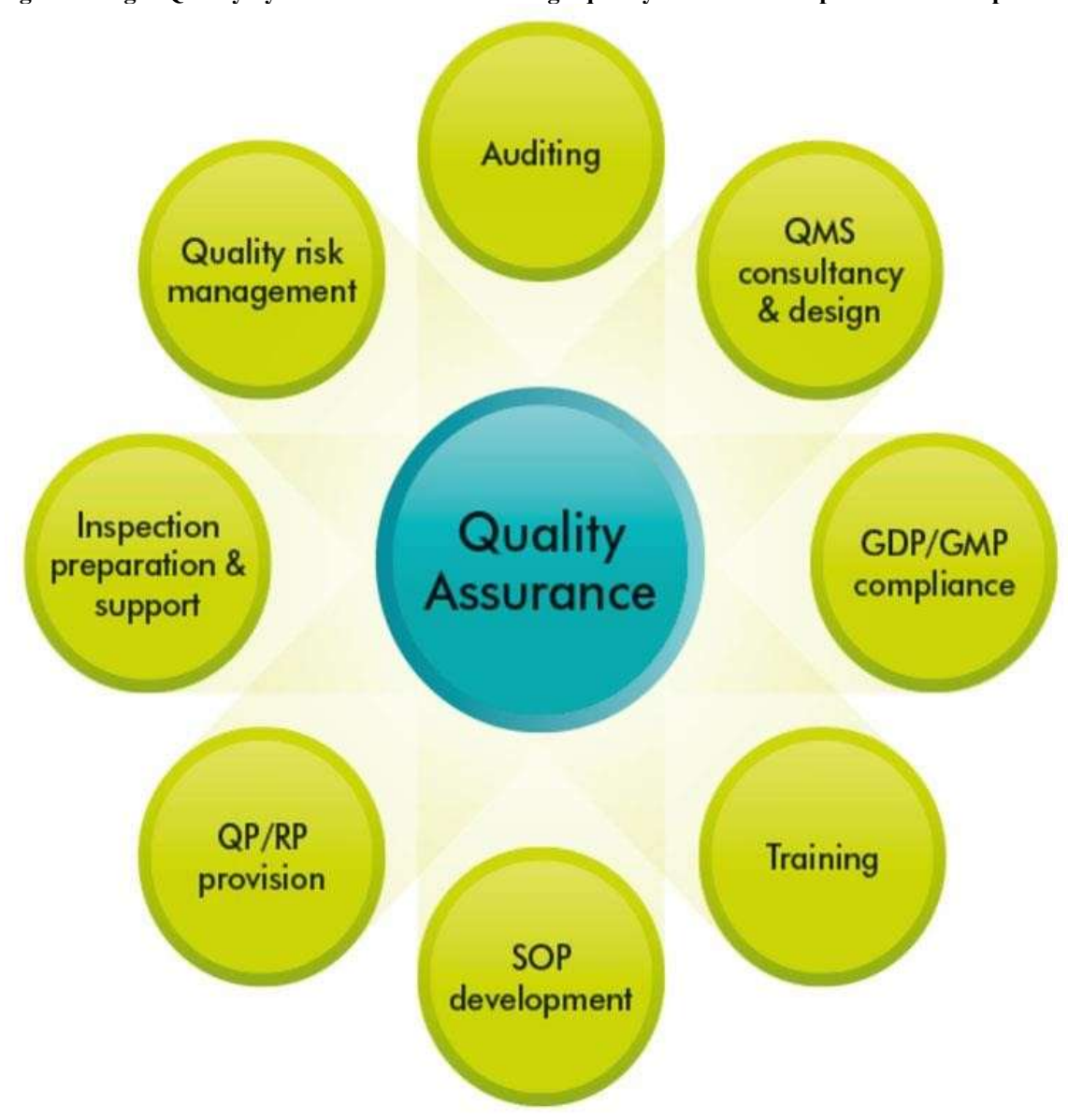
Figure 1: Eight Quality Systems contribute to the high quality of the finished pharmaceutical product

Volume 8, Issue 6 Nov-Dec 2023, pp: 829-841 www.ijprajournal.com ISSN: 2249-7781